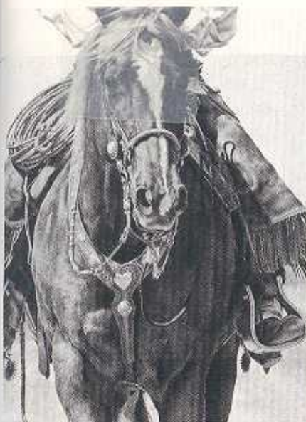
Heart of Gold, 16 by 23 inches

Newest piece: The piece I've created for the Coors Western Art Exhibit & Sale is the largest drawing I have ever done. It shows a horse in each of the three stages of bridle-horse training. It took a long time to draw, but it'll be beautiful on opening night.