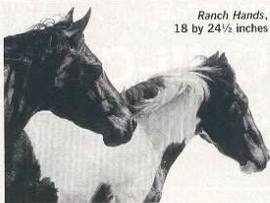
Ranch Hands, 18 by 24½ inches

For more information: Visit on the Web karmeltimmons.com or altermann.com .